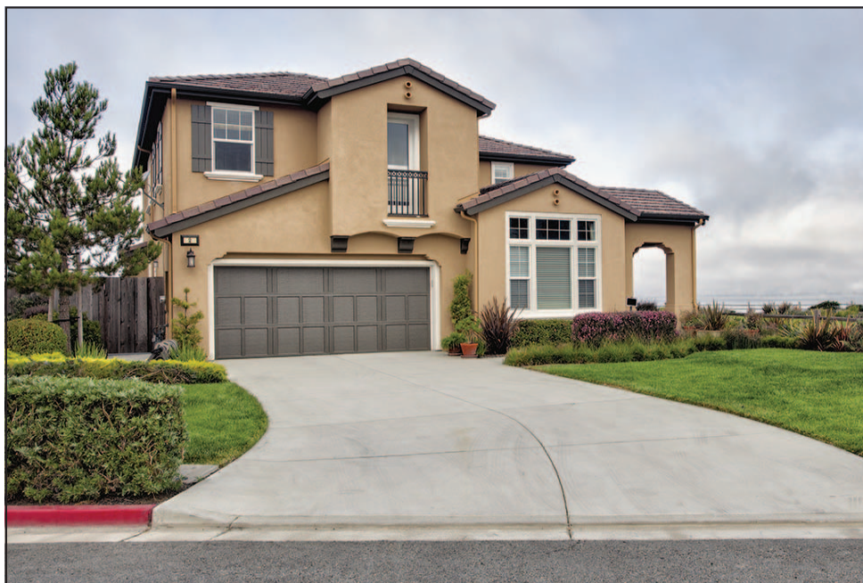
Knowing which improvements add value to a home can help homeowners tailor their efforts to those that are most financially beneficial.

can offer a 94.9 percent ROI, says Remodeling. And after doing the front door and siding, investing in a garage door replacement offers the highest ROI of all exterior projects.